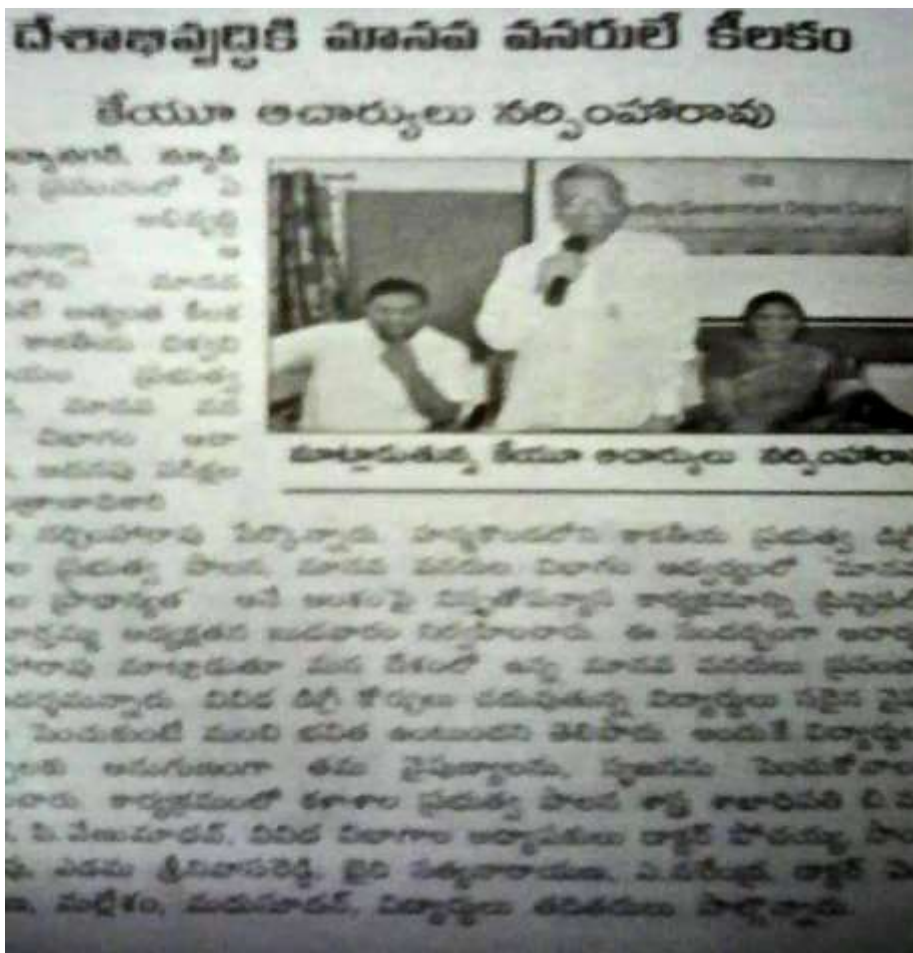
News coverage of the Seminar